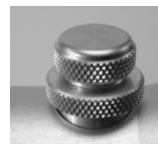
Turn to adjust