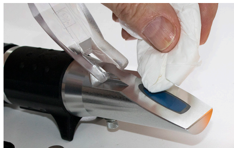
Clean the prism with water and a clean tissue or cloth

The prism surface could be damaged by strong alkalis or acids if left in contact for long periods of time.