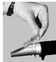
Replacing the illuminator flap

Should the illuminator plate become damaged or lost, simply replace it by clipping a new one in place.